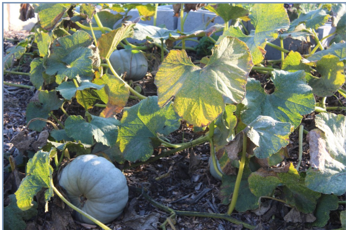
FOOD 4 THOUGHT