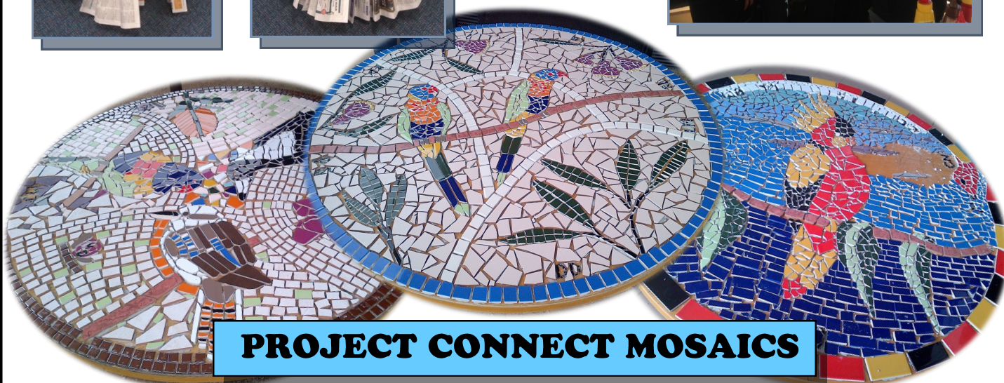
PROJECT CONNECT MOSAICS