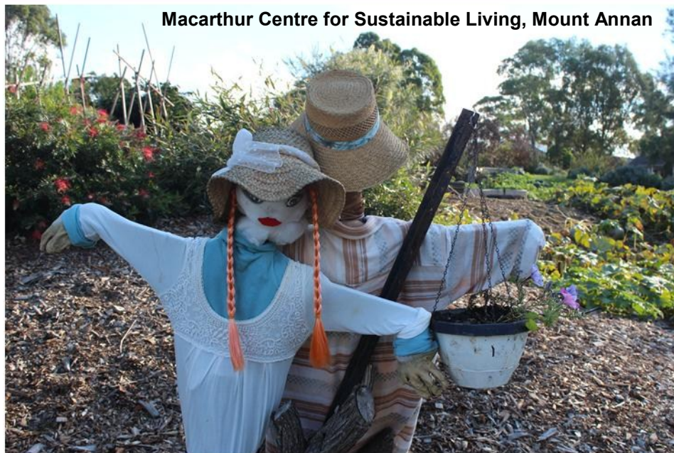
Macarthur Centre for Sustainable Living, Mount Annan