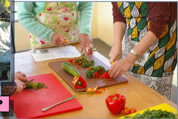
MOUNT ANNAN GIRLS GROUP