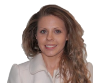
Tearn Page Youth Worker