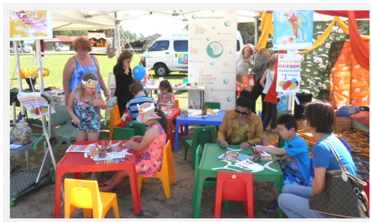
Narellan Rhythms Festival, October 2014