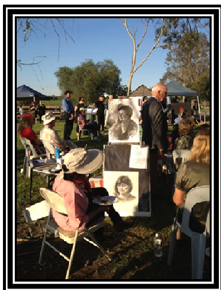
Camden Town Farm, Harmony Day 2012

Submit your photo for a chance to win a double pass to Dumaresq Street cinemas. The winning photo will be featured in the Autumn Issue of Community Connections. Email info@camdenconnections.org.au